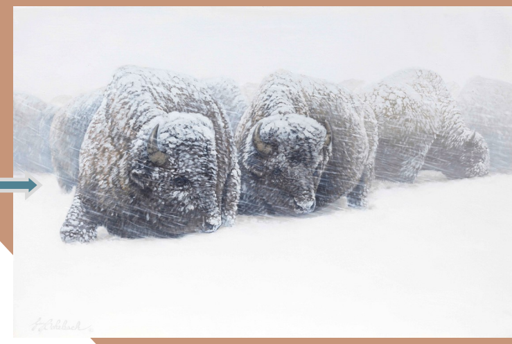
© Guy Coheleach, Winter Whiteout , oil on linen, 2011, Collection of the artist