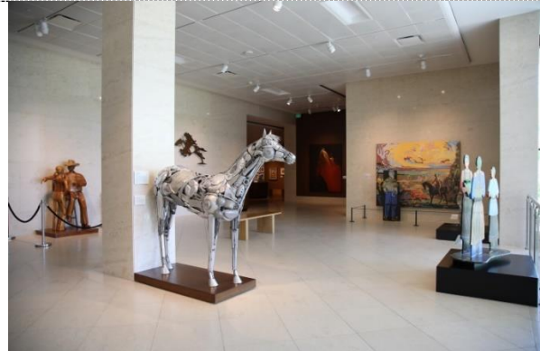
Upper Sculpture Court and Atrium