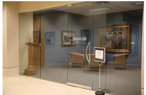
Museum Library and Offices