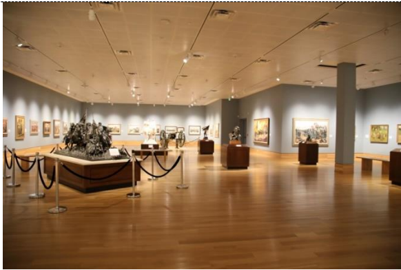
War is Hell Gallery