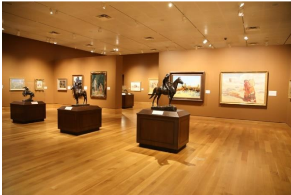
Enduring Traditions Gallery