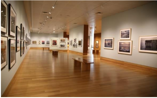
Picturing America Gallery