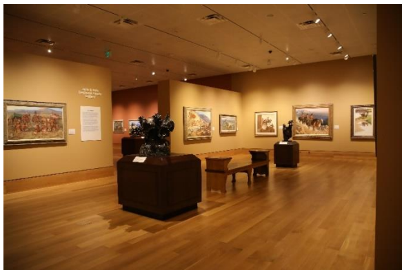
First Peoples Gallery