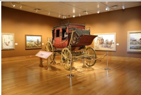
Heading West Gallery