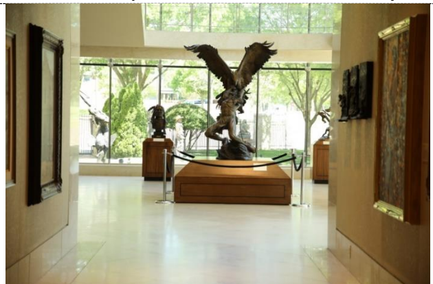
Lower Sculpture Court and Atrium