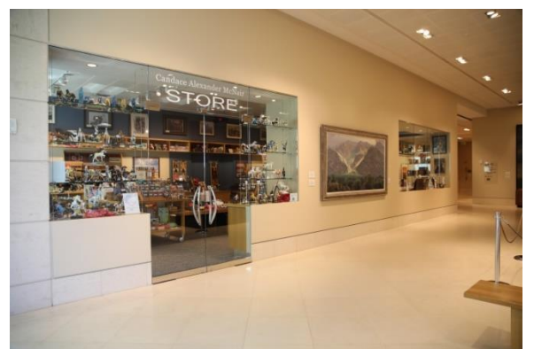
McNair Museum Store