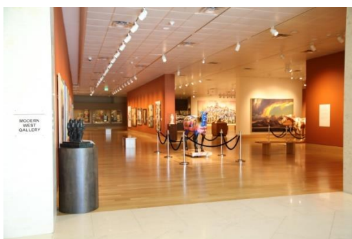
Modern West Gallery