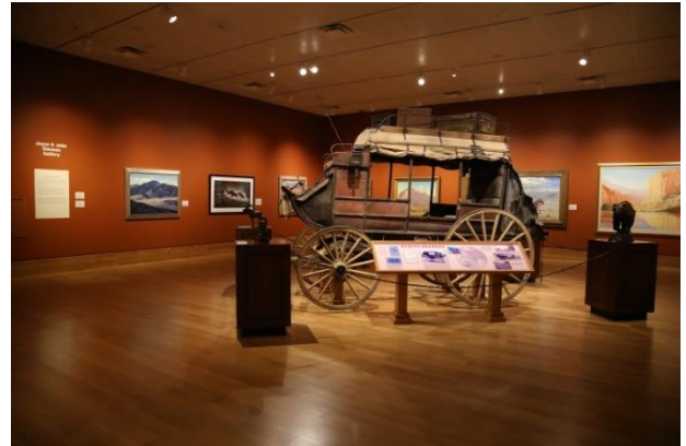
Landscape and Wildlife Gallery