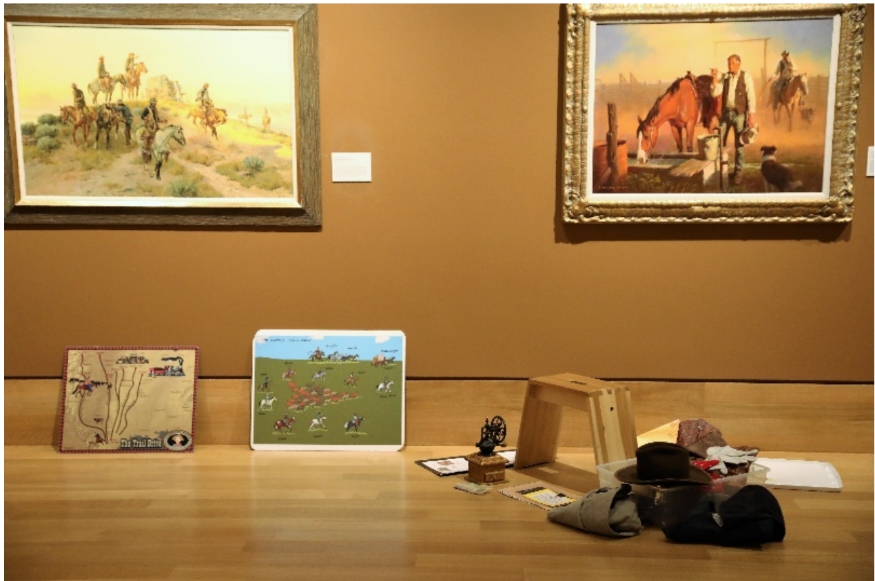
(Right): Charlie Dye, Starting the Big Circle , 1965, Oil on Canvas

We will go to the Cowboy Gallery and sit by the painting Starting the Big Circle by Charlie Dye to talk about cowboys and cattle drives.