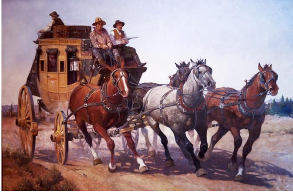
Joe Ferrera, Overland Stage Line , 2002, oil on canvas