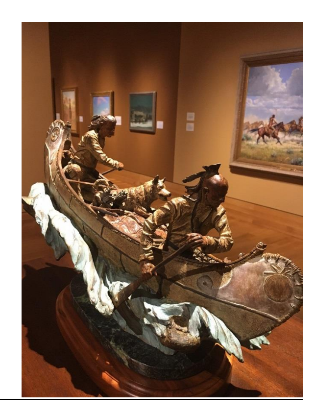
Running the Gauntlet, detail