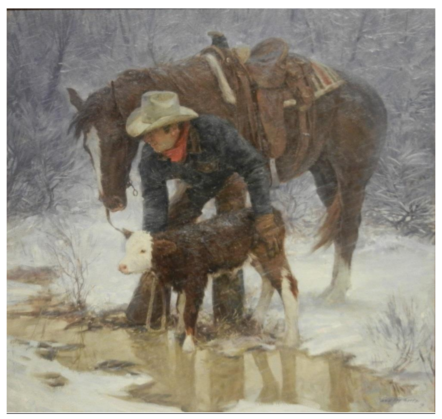
Loren Entz A Helping Hand, 1994, oil on canvas, 45 x 47 x 1.62"