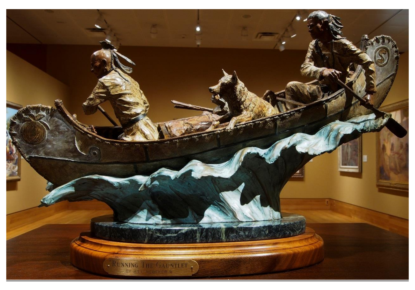
Bill Nebeker, Running the Gauntlet, 1990, bronze, 11.5 x 24 x 8.25"