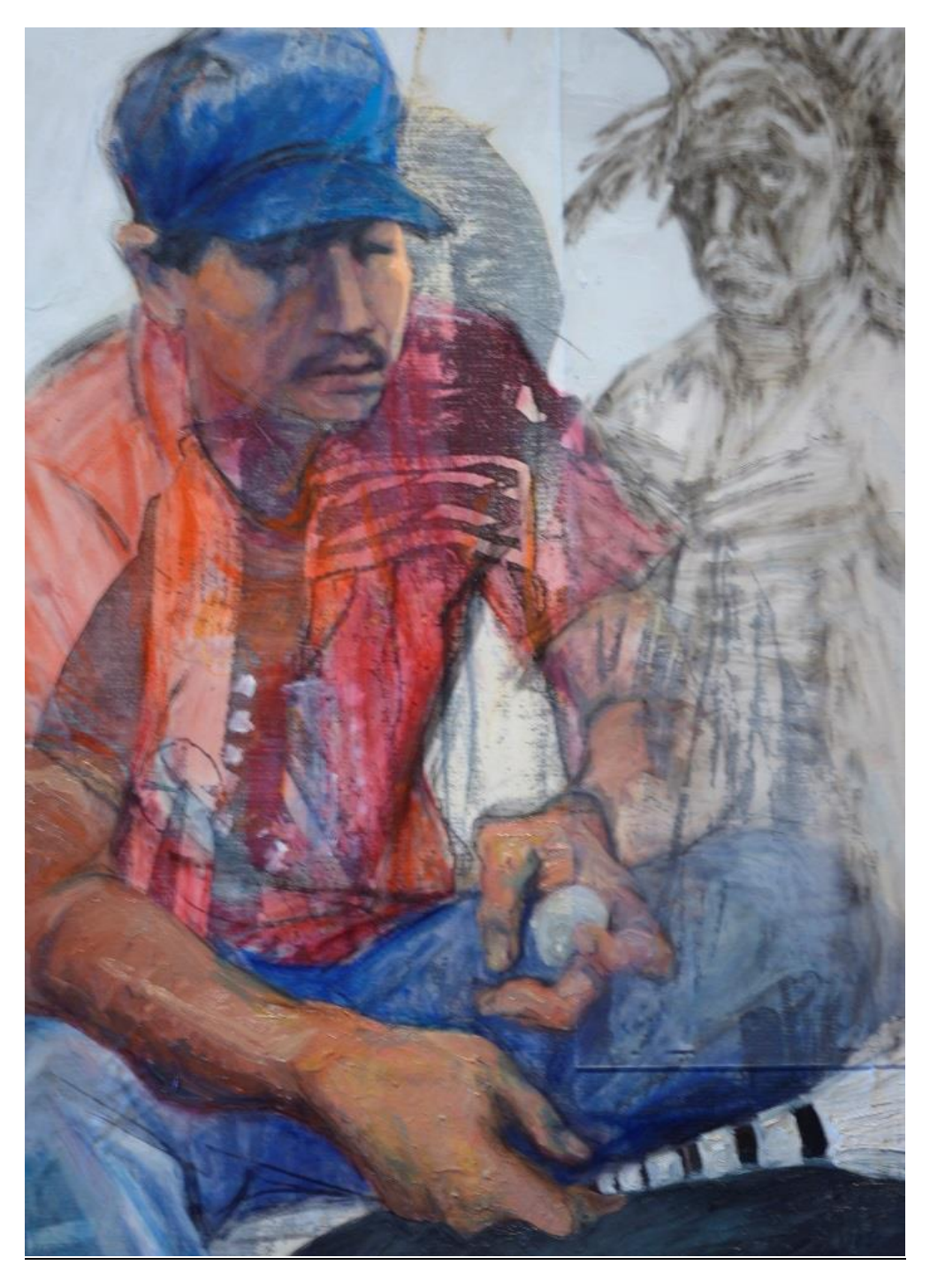
Dolores "Dee" Venzer, In Touch with My Heritage, 2002, mixed media on canvas, 50 x 36"