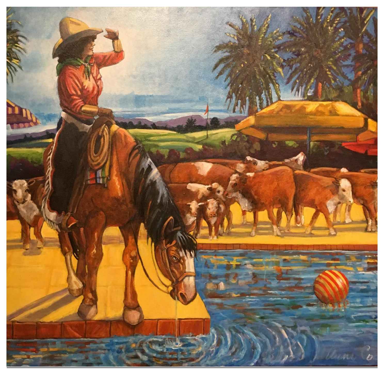
Ann Coe, Suburban Ranchette: The New Watering Hole, 2000, acrylic on canvas, 42 x 48"