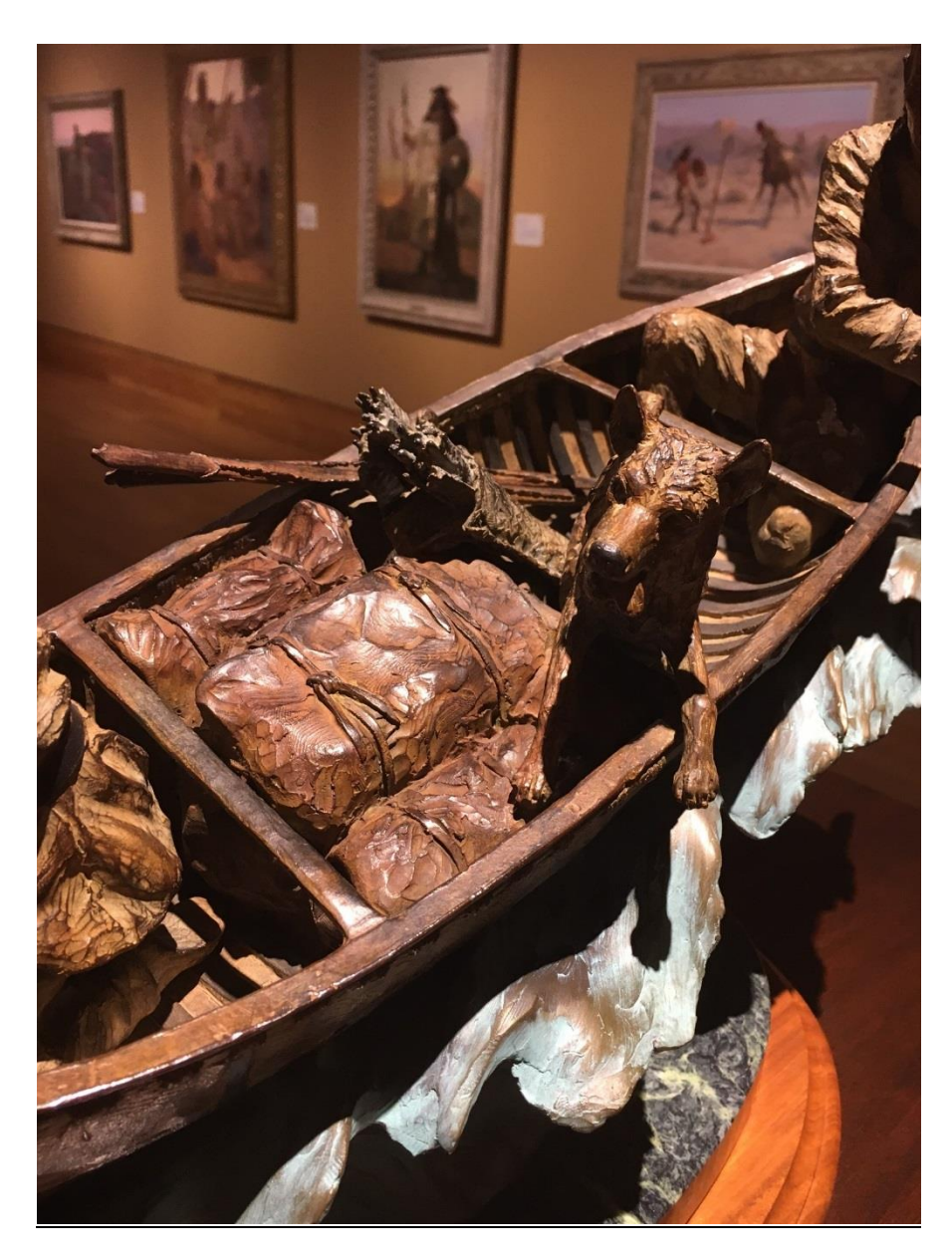
Running the Gauntlet, detail