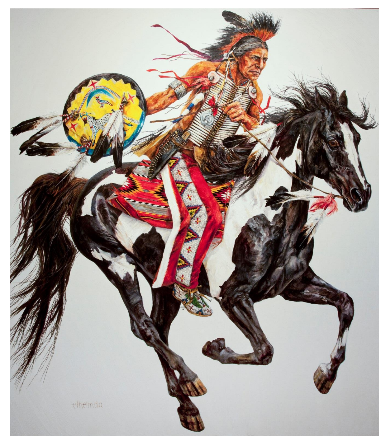
Ethelinda (Robbins), Montana, 1880, 2001, oil on canvas, 78 x 68 x 1"