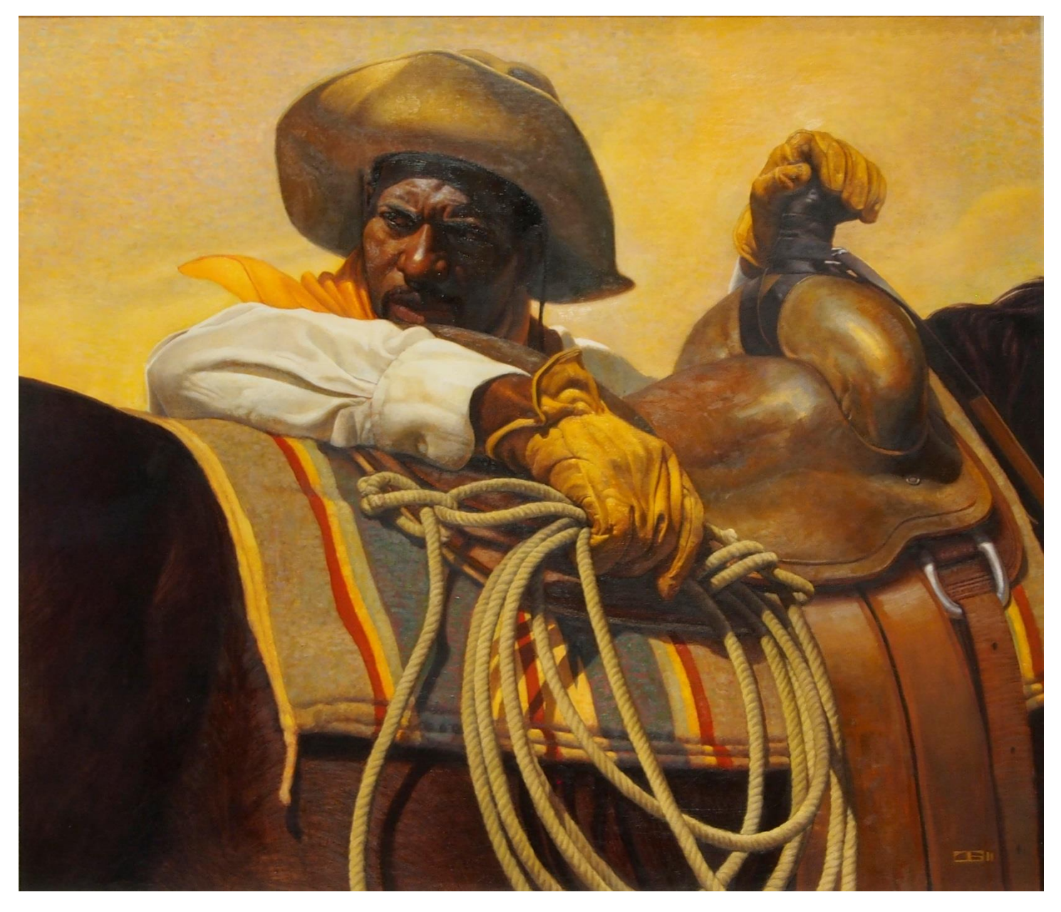
Thomas Blackshear, Now What?, 2008, oil on canvas, 24 x 37 x 2"