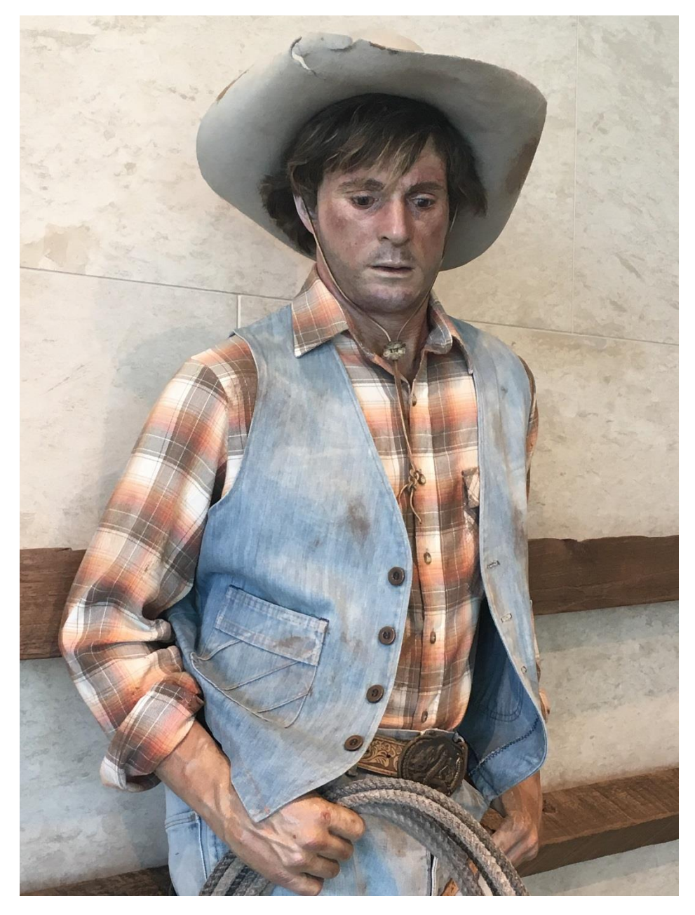
Working Cowboy, detail