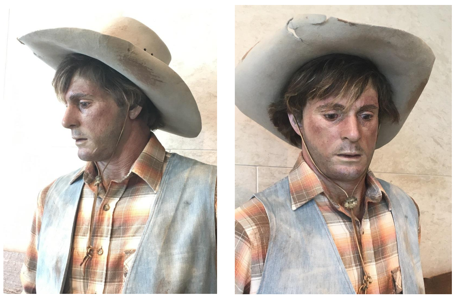
Working Cowboy, detail