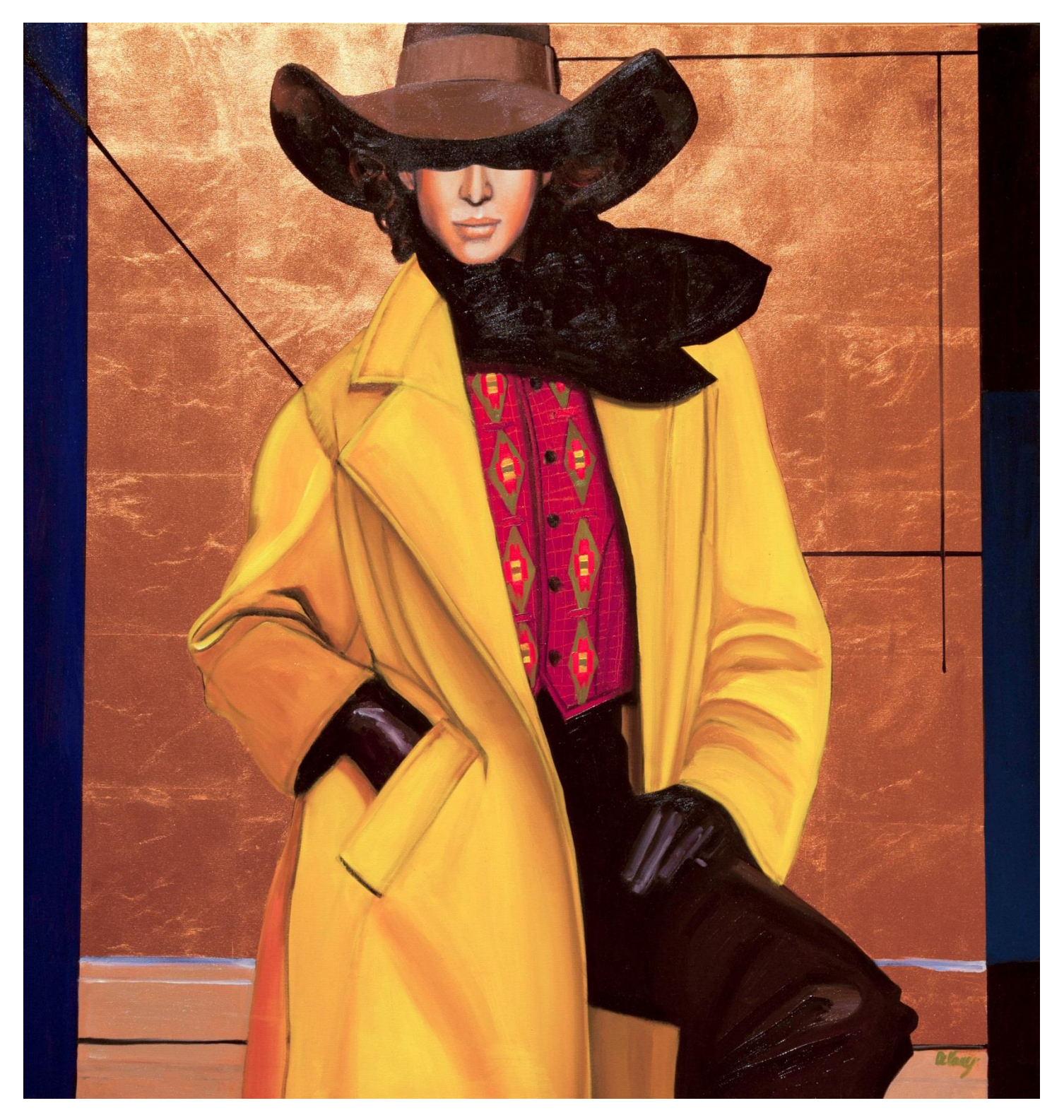
David DeVary, Red Vest, 2000, oil on canvas, 36 x 36 x 1.5"