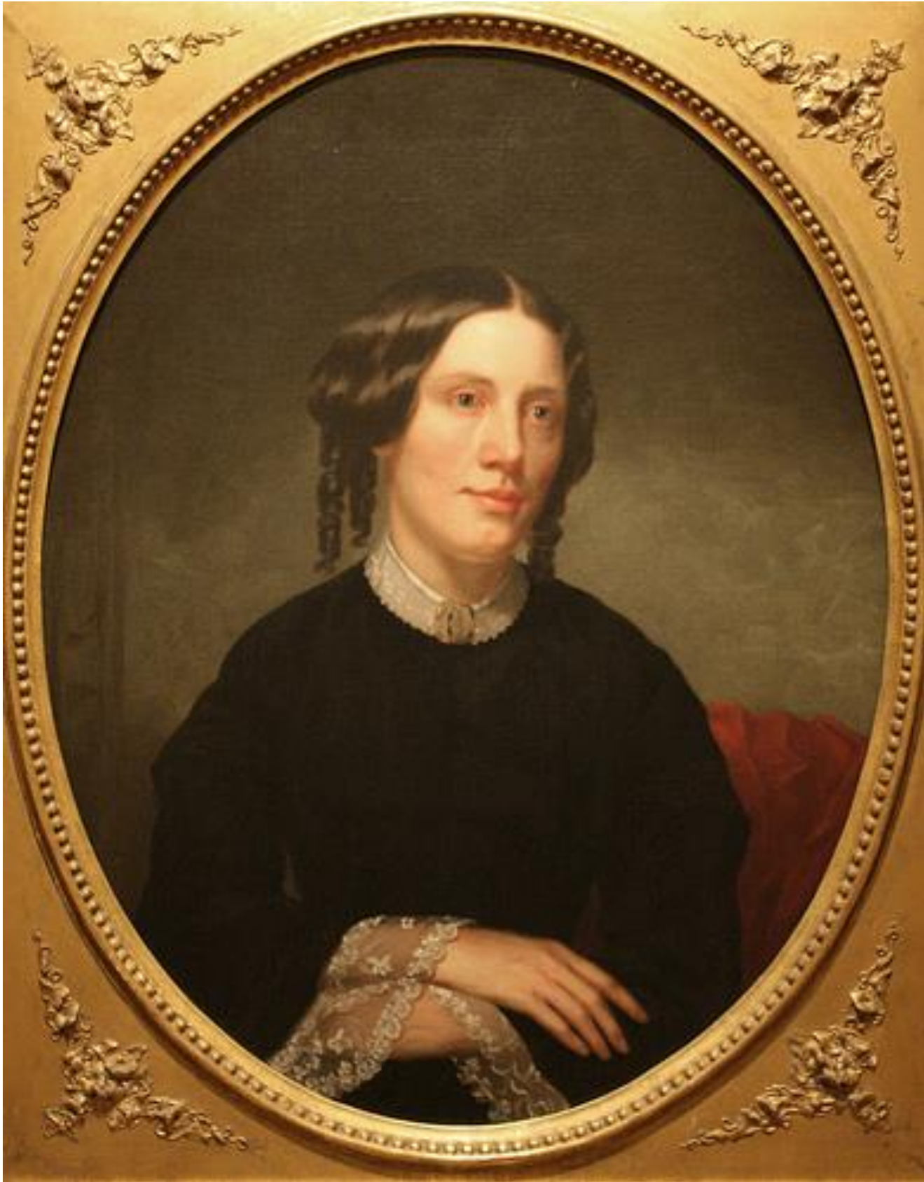
Harriett Beecher Stowe