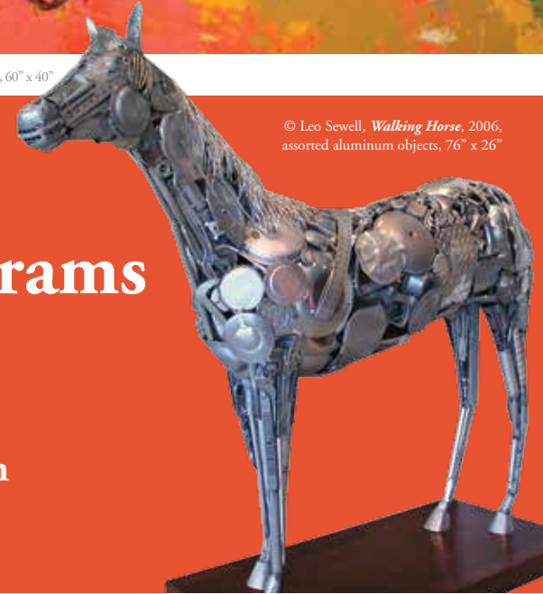
© Leo Sewell, Walking Horse , 2006, assorted aluminum objects, 76" x 26"